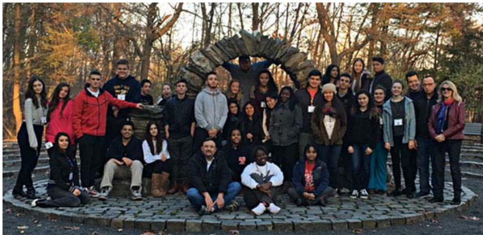
Sacrament Program at SFP

The Junior retreat was a remarkable experience this year. This immersive retreat experience program was designed for and available to juniors only. Centered on the theme of "journeying," students took time to reflect, discuss, and pray about their life and the many new responsibilities and pressures associated with junior year and college preparation. The retreat was held at the beautiful Holy Family Passionist Retreat Center in West Hartford, CT. Thirty students attended the retreat and are pictured below in front of the retreat center's prayer labyrinth.